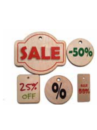
hangers, advertising pads