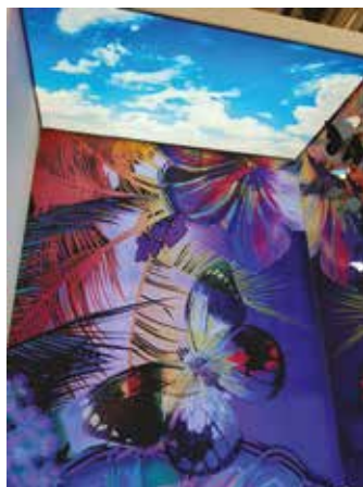
back-lit textile frame