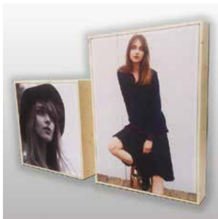
wooden frame with textile