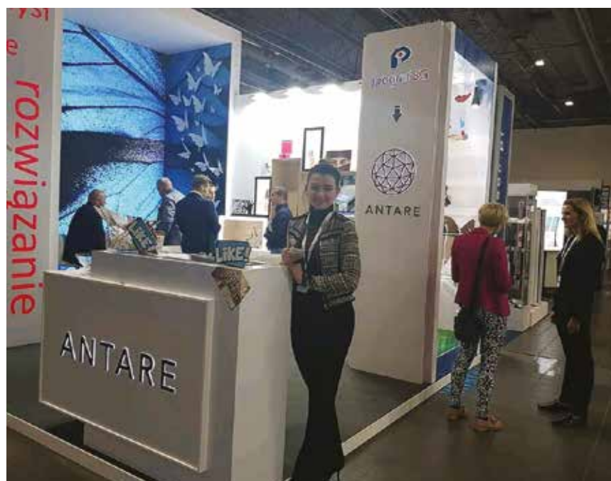
Retail Show 2019

Participation in trade events is of immense importance to us. It is where we learn about new technologies and materials, and where we find new inspirations.