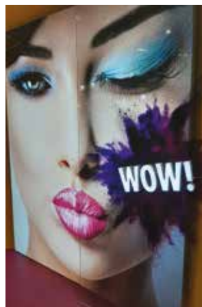
Window display of a sales showroom