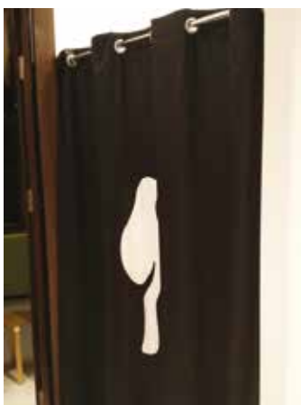
panel; backdrop with the Client's logo