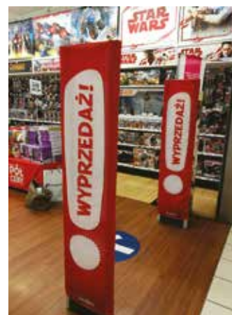
anti-theft textile gate