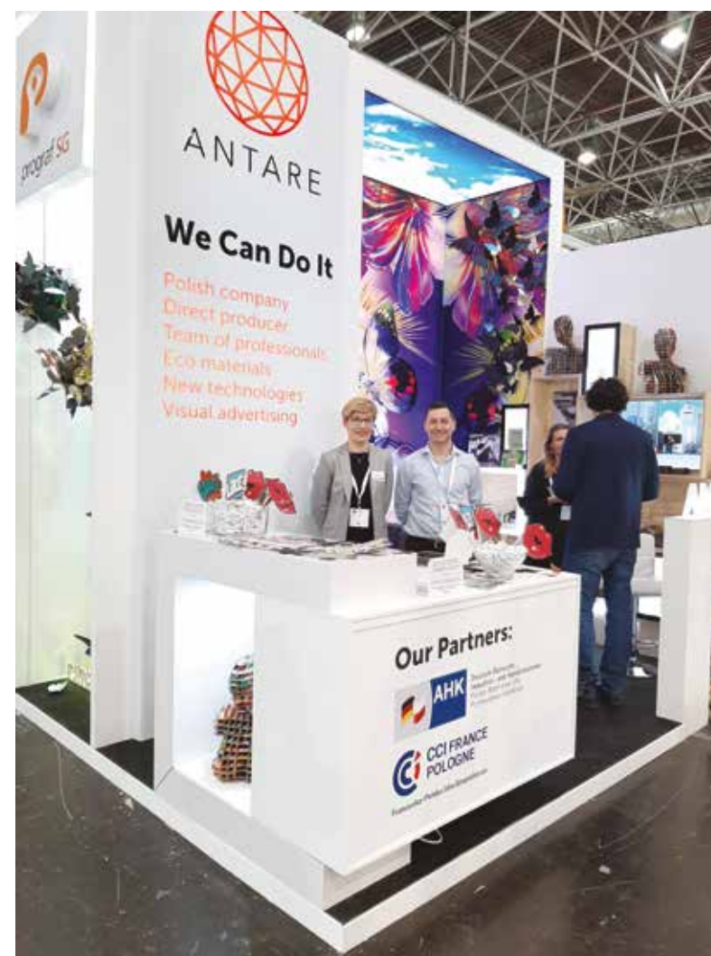
Euro Shop 2020