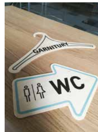
signage and communication hangers