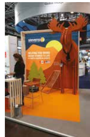
Arrangement of the fair stand