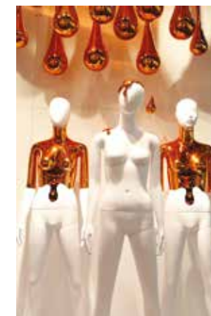
Window display of a sales showroom