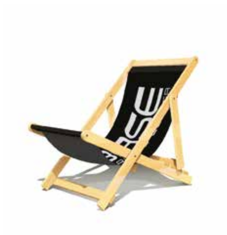
advertising reclining chair